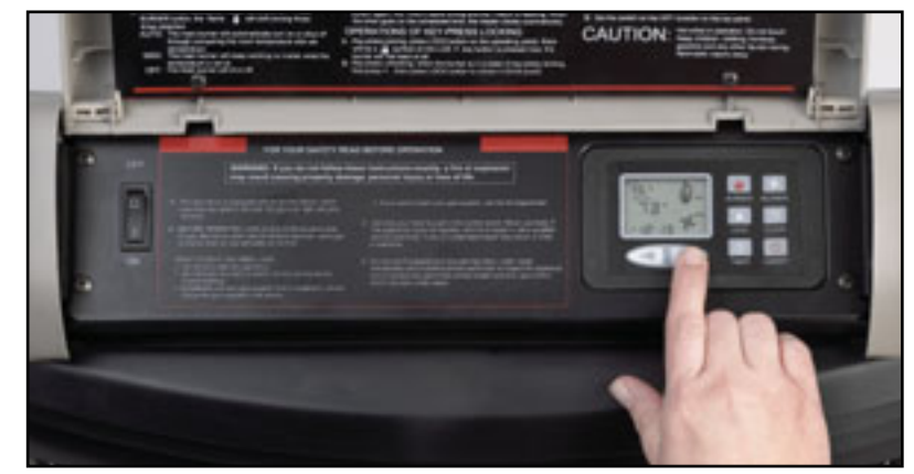
Touch Pad Controls